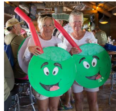
A few photos from the last Coconut Crawl