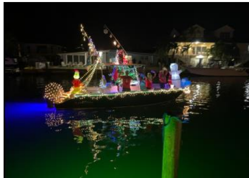
Most Creative - Coco's Boat Rentals – Jason Peterson