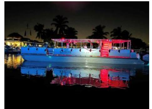
Most Creative - Two Conchs Island Touring – Capt Jeff